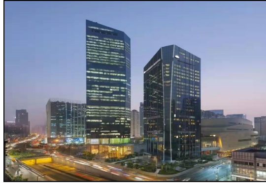
Mandarin Hotel, Guang Zhou