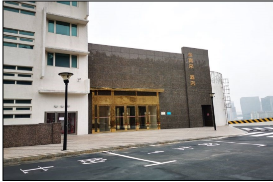
Kim Bo Lai Hotel, Macau: